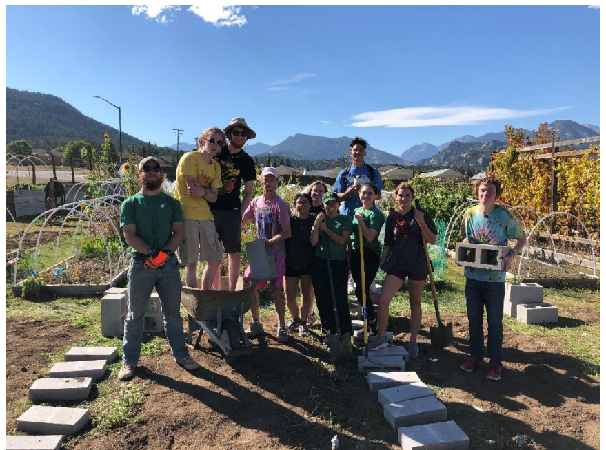
Figure 2 YMCA Elevate Gap Program

You can contact us at evcg@evcg.org , or learn more about the Garden at evcg.org .