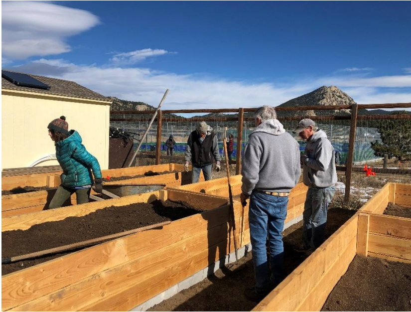
Figure 1 Volunteers Working on a beautiful fall day.

The project is approximately 80% complete and will be finalized in the Spring before the start of the 2024 growing season. The final steps will be to add a final mixed layer of soil, mulch, and compost to each bed, as well as to connect the beds to the garden irrigation system. To date, over 500 volunteer hours have been spent on the project.